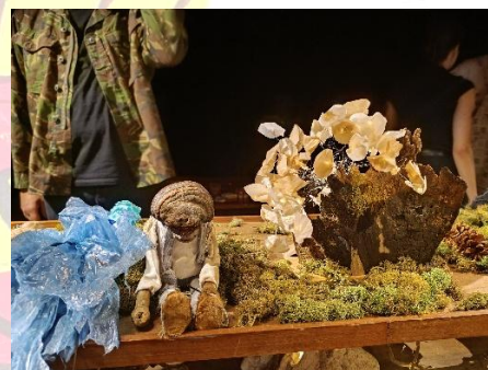
Marionette and object theatre Fabula Sylvertris Musasi Entertainment Company