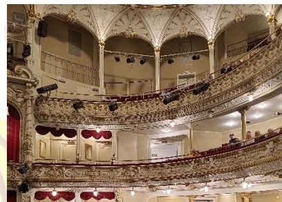
Theatre F.X. Šalda, Historical central venue