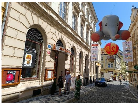
Naive Theatre, Materinka Festival Headquarters