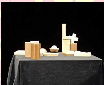
Object Theatre, The Block Theatre, Company : Ko Koo Mo