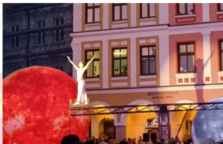
Festival Performance Spectacle, First Step VOSA Theatre