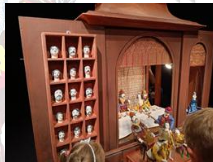
Marionette Puppetry Long Broad and Sharpsight Company : Minor Theatre