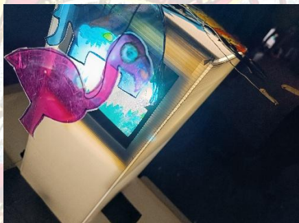
Shadow Puppetry Amarbari Unterwasser Theatre Company