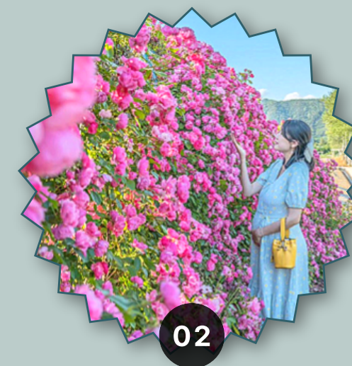
Photo zones in the flower fields