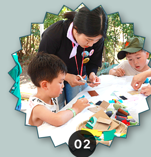
Citizen participation programs