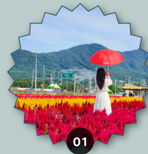
Colorful umbrellas for photoshoot