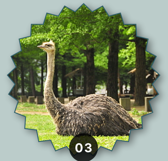
Nami Island's mascot, Kkangta