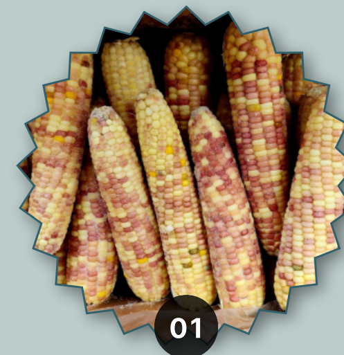
Gangwon Province's famous corn