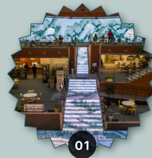
Technology Fusion Content Exhibition