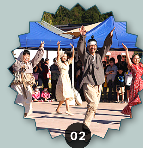
1930s Cheorwon! Modern Times Performance