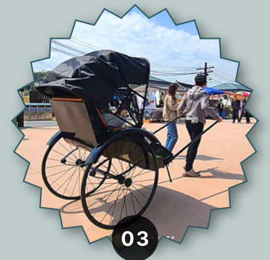
Rickshaw Ride Experience