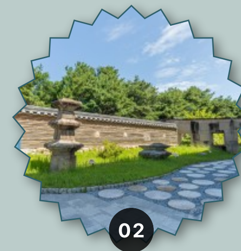
Outdoor Garden Exhibitions