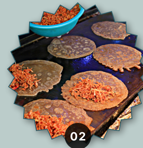
Gangwon's traditional dish, chon-tteok