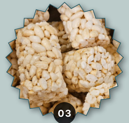
Market's staple snack, puffed rice