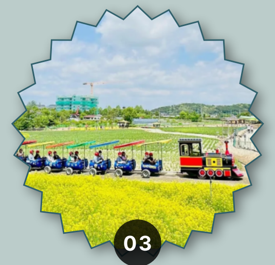
Barrel train riding through the fields