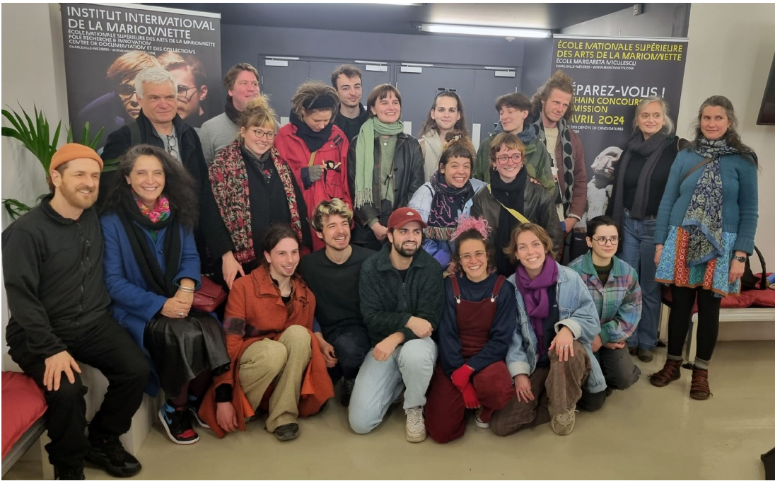
The successful candidates accompanied by members of the competition jury - 23 April 2024