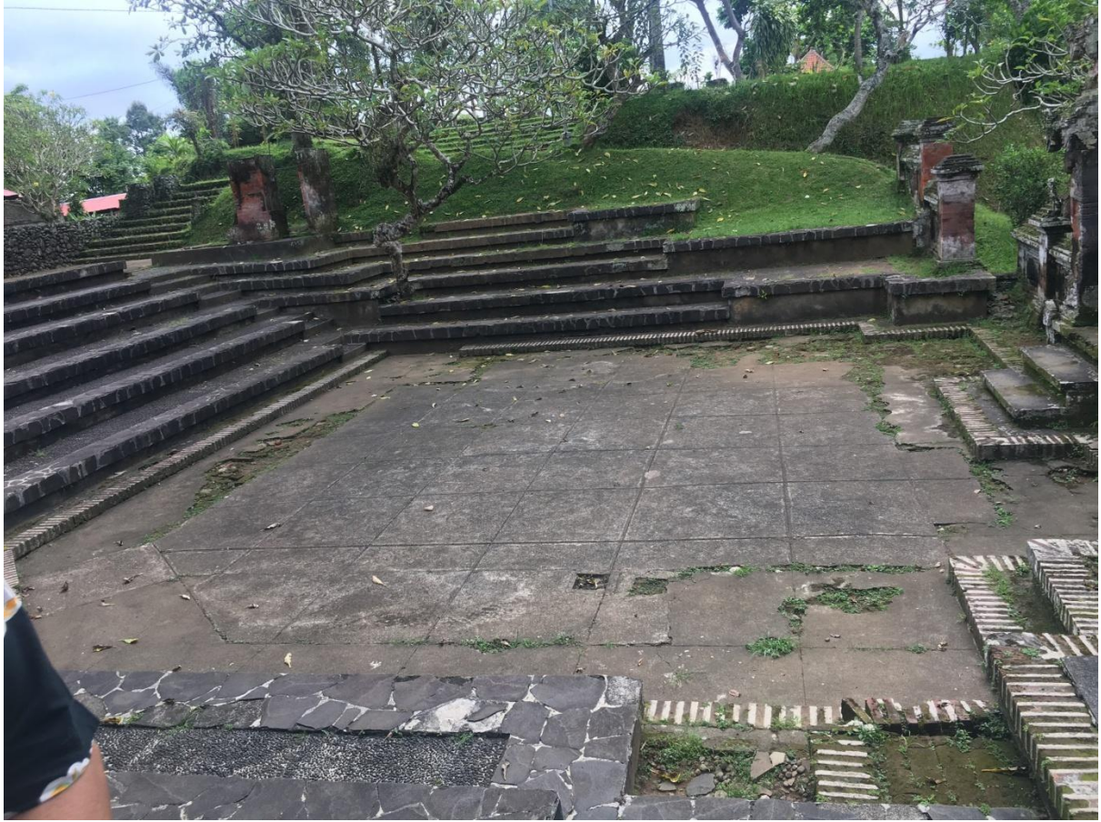
The temple is amazing