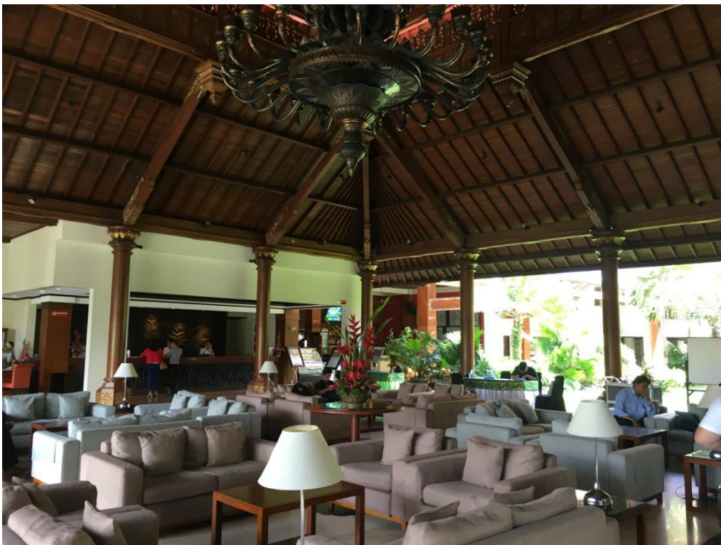
Entrance Hall of Prime Plaza Hotel

We visit several Hotels: Grand Bali Beach Hotel, Prime Plaza Hotel, Hotel Sanur Argung, Patrishia Hotel, and Puri Dale M Hotel.