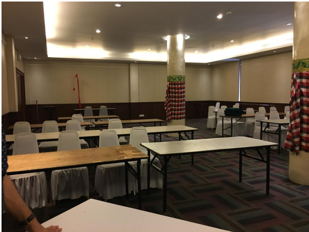
Meetings rooms - there are four like this