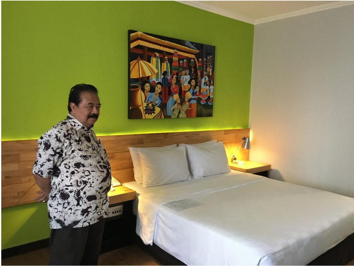
Rooms of the Prime Plaza Hotel - there are 187 rooms of this kind