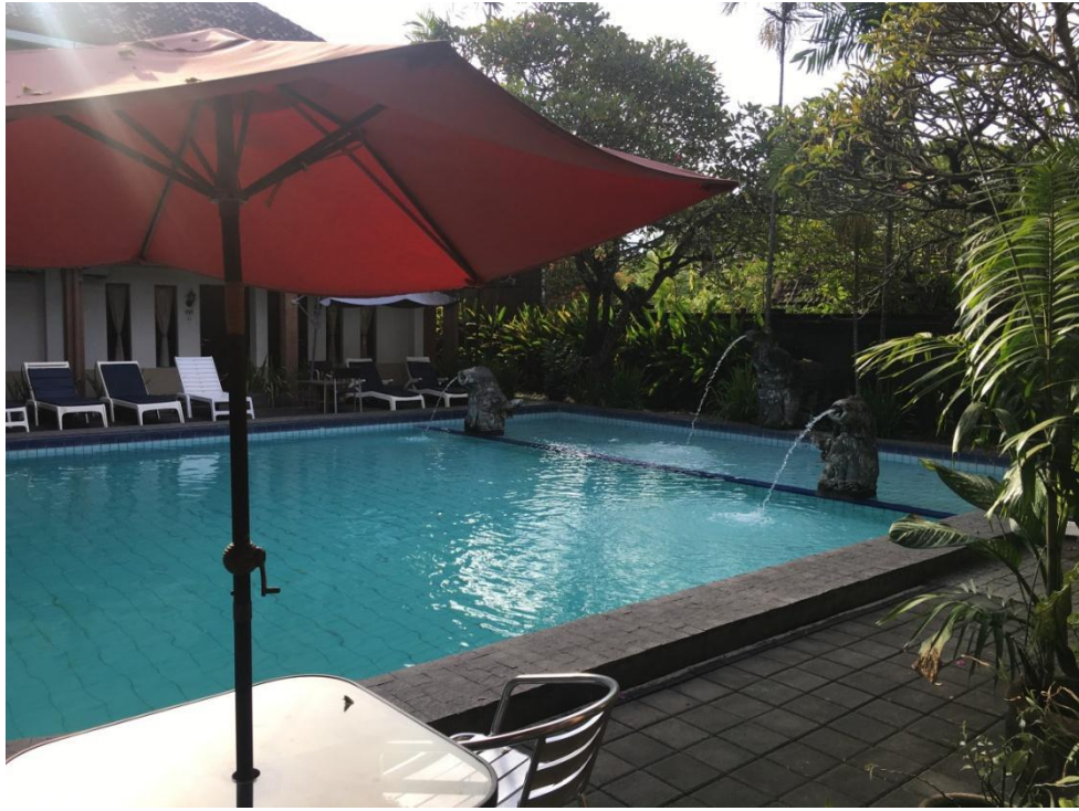
Hotel Sanur Agung - walking distance from Prime Plaza Hotel - 42 rooms