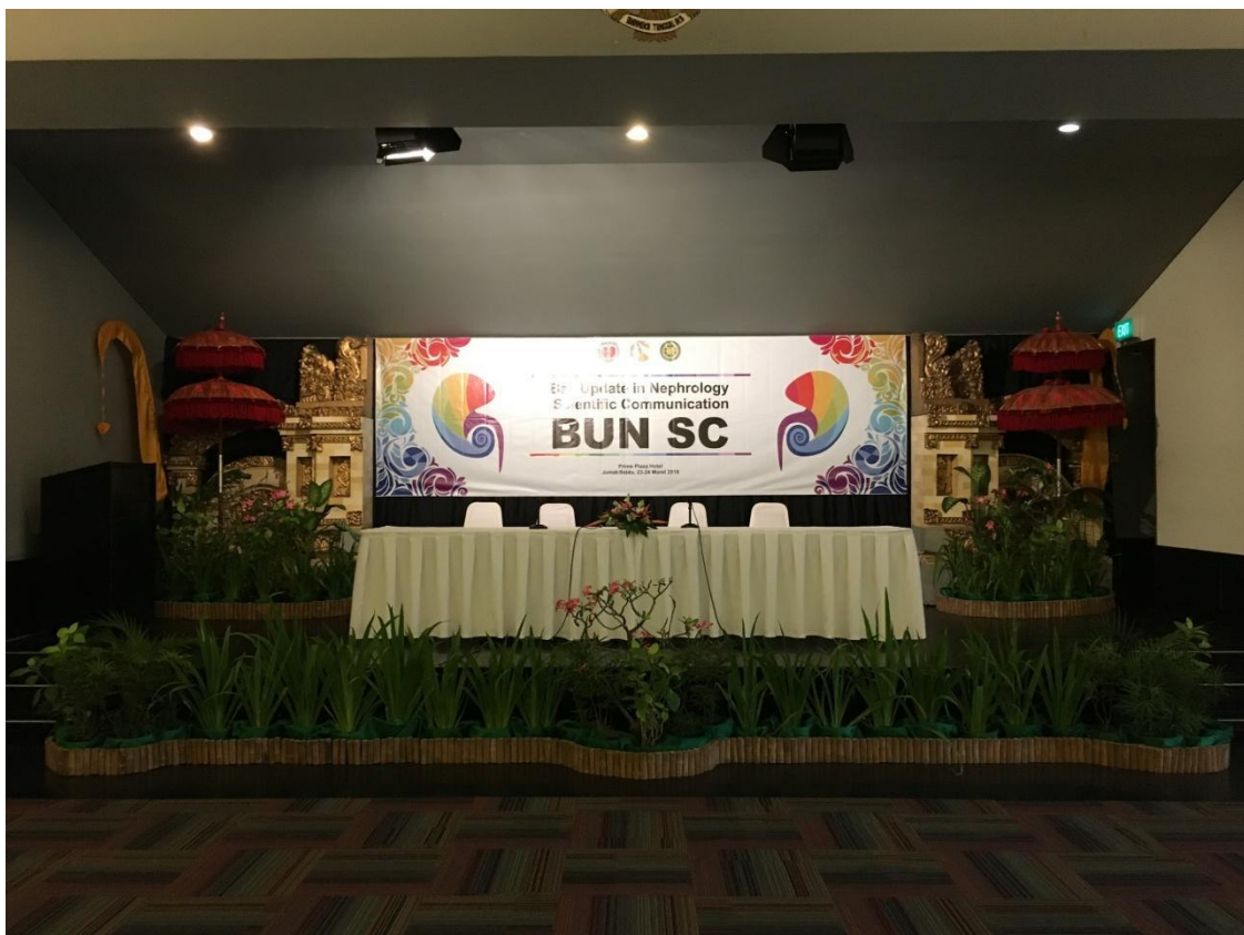
Another possibility for the meeting room or for performance room