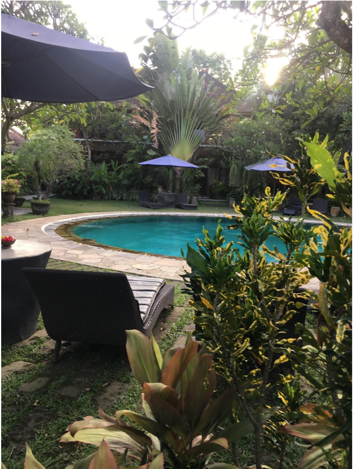
Swimming pool of this hotel