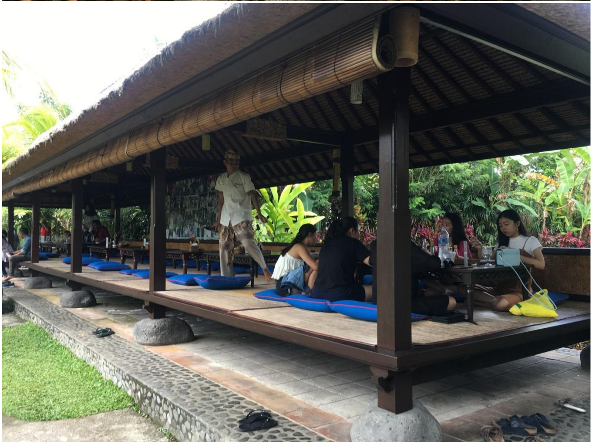
After lunch we visit the temple of Gua Gajah & Pura Samuan Tiga .