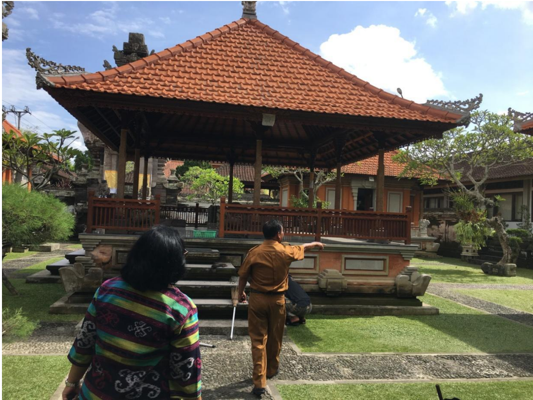
Entrance of the Archeological Museum