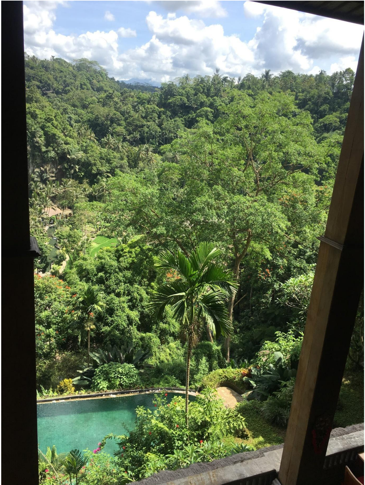
One of the swimming pools of the Hotel which is located in the middle of this amazing vegetation.