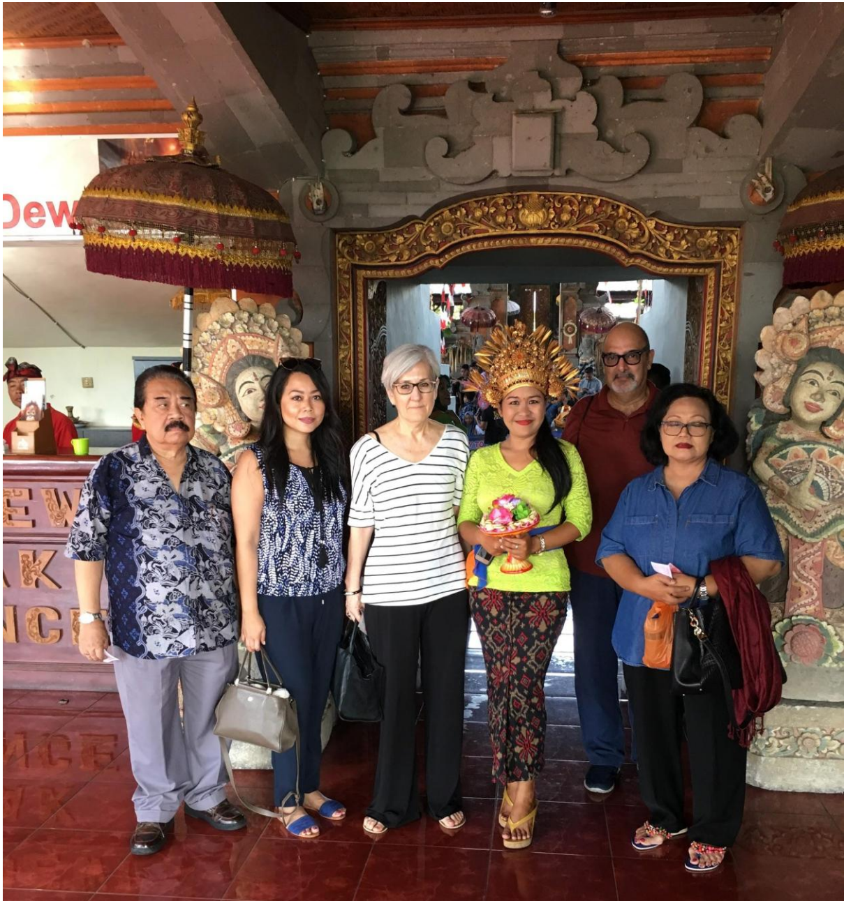
Entrance to the Batubulan