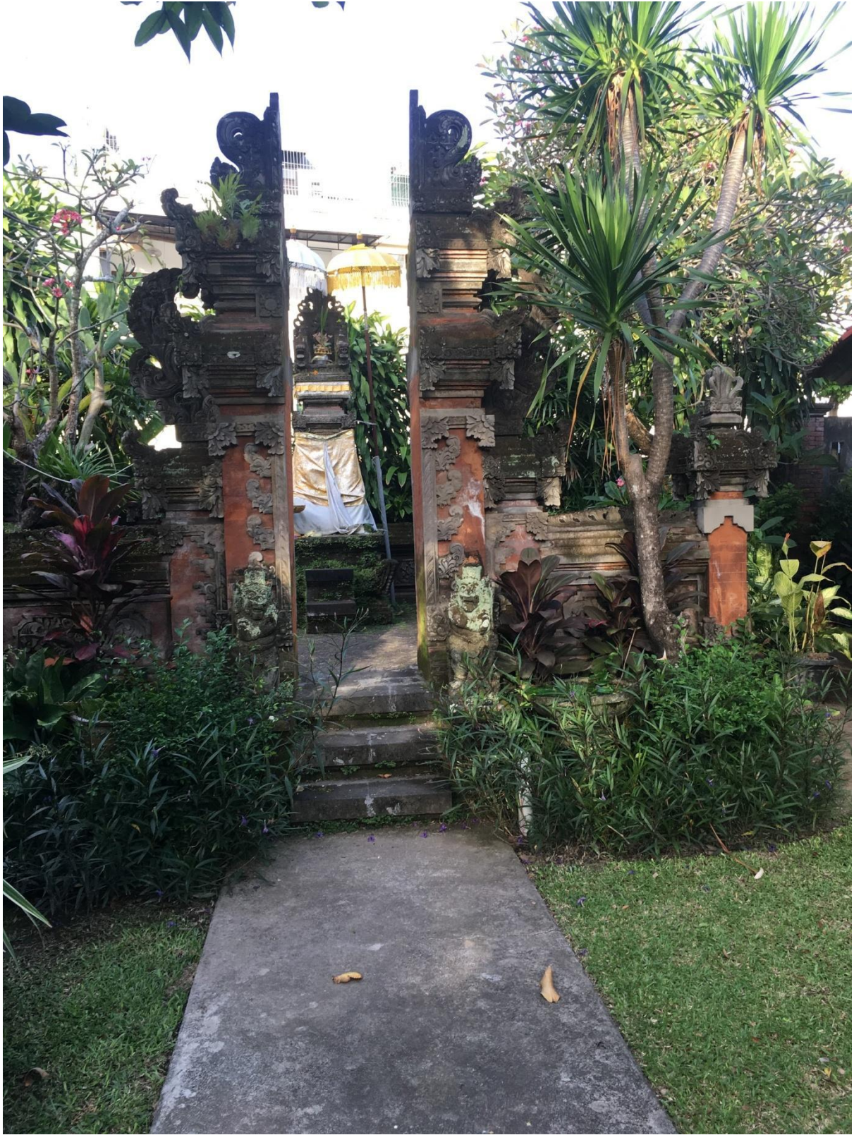
Gardens of the Hotel