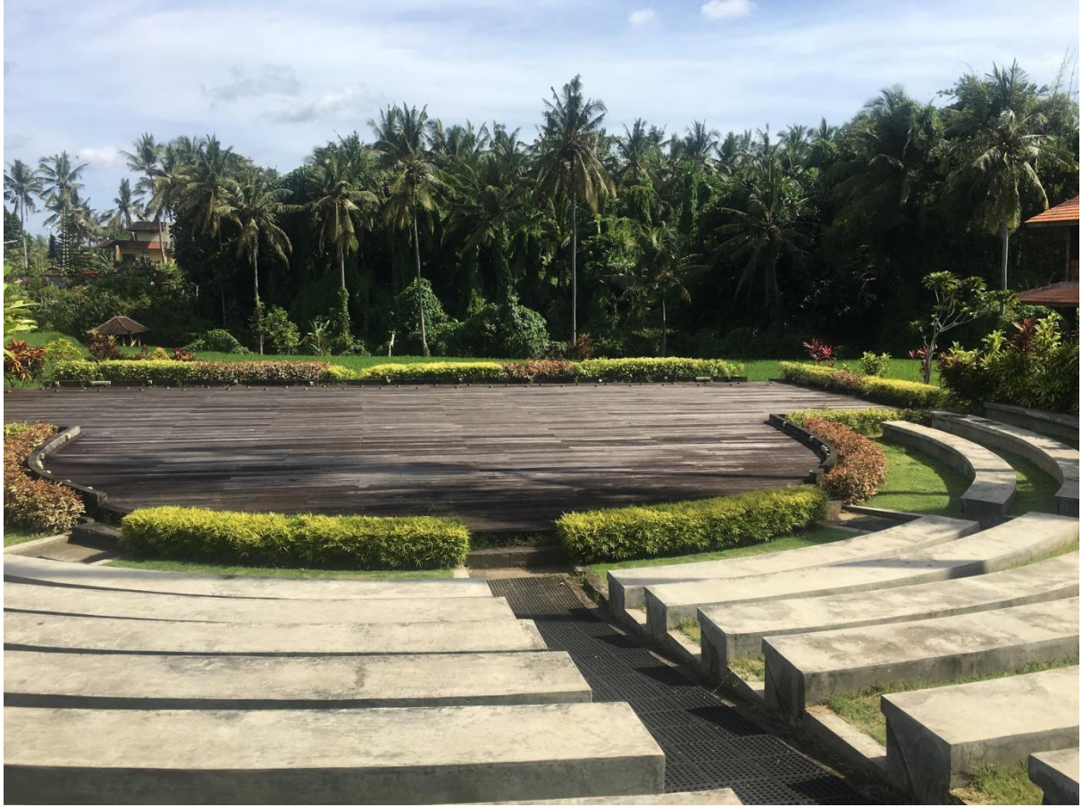
Amphitheater at the Museum