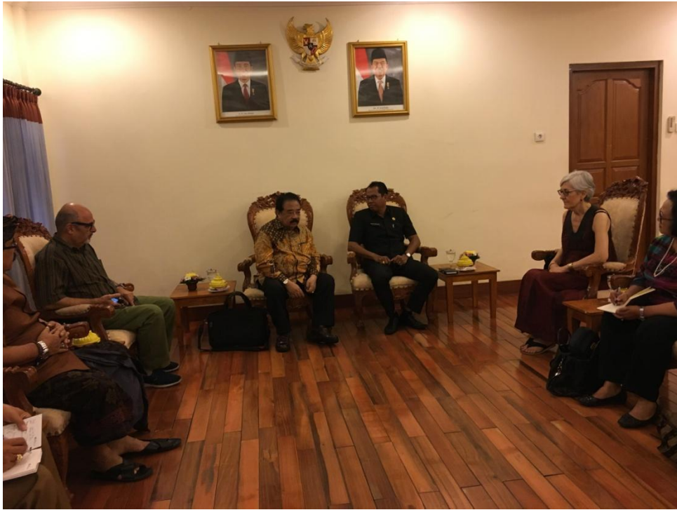
With the Regent of. Gianyar