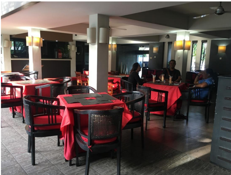
Reception and breakfast room