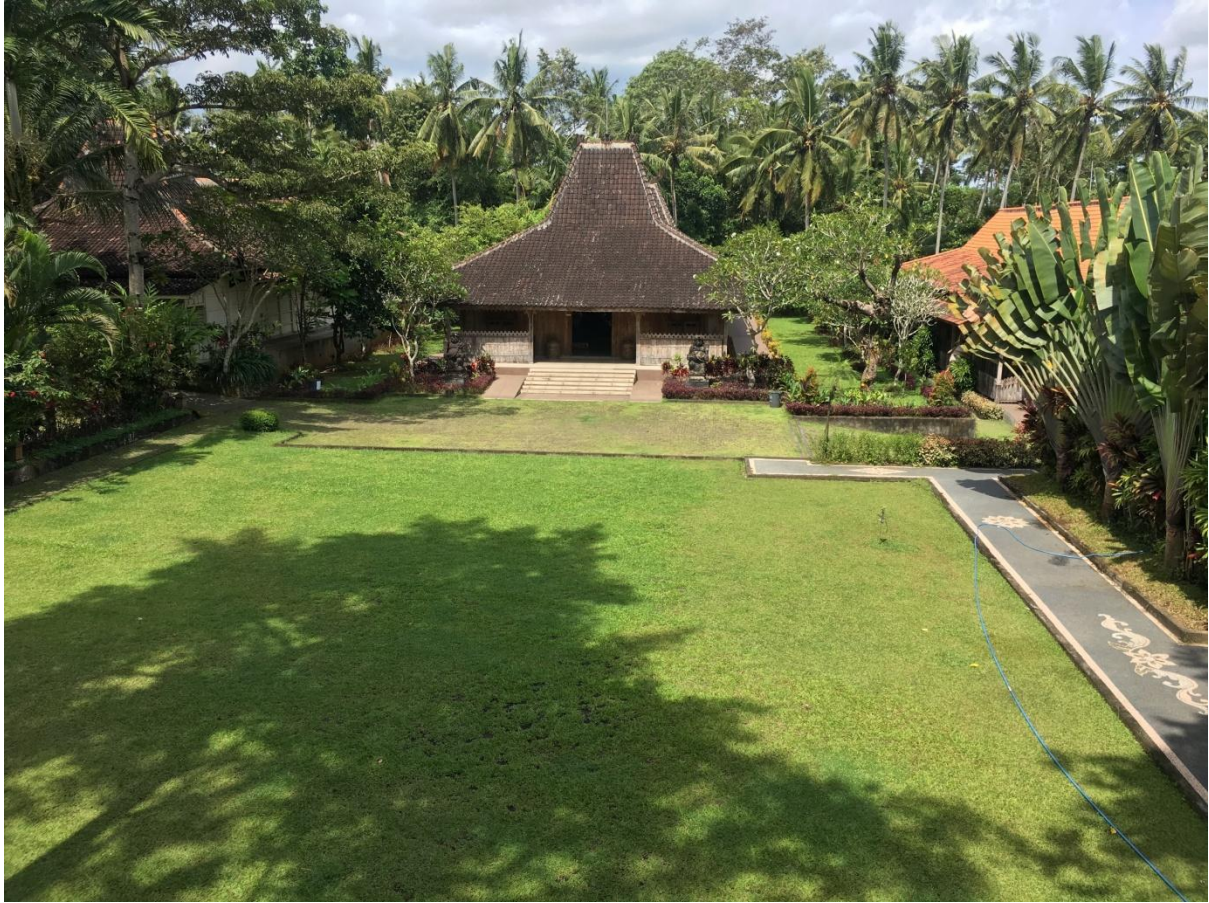
Entrance to the Museum