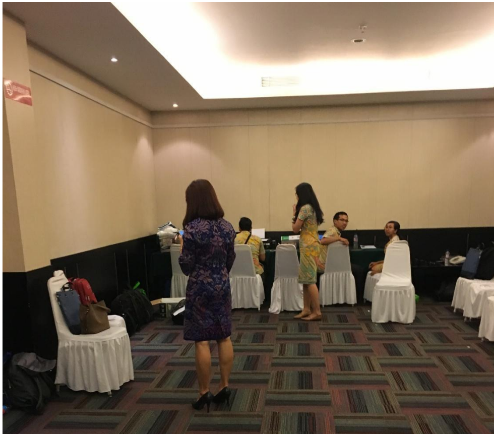
Room to set up the secretary