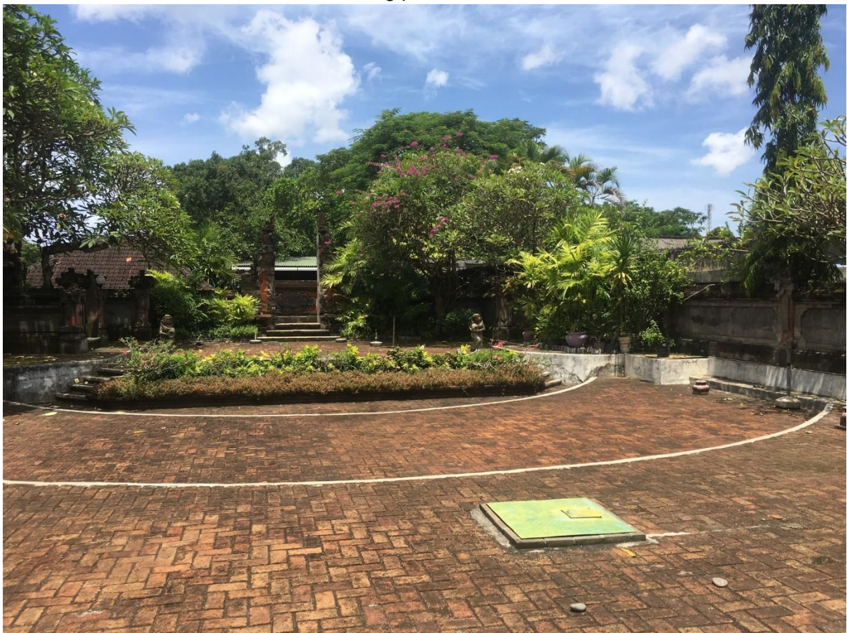
Open Air Auditorium

The other two hotels we visited for lodgment are: