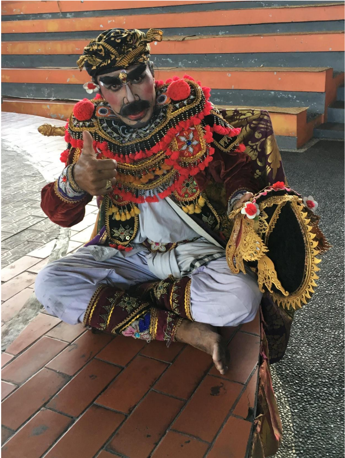
Lunch at Bebek Tepi Sawah, it is a beautiful restaurant located on a rice field