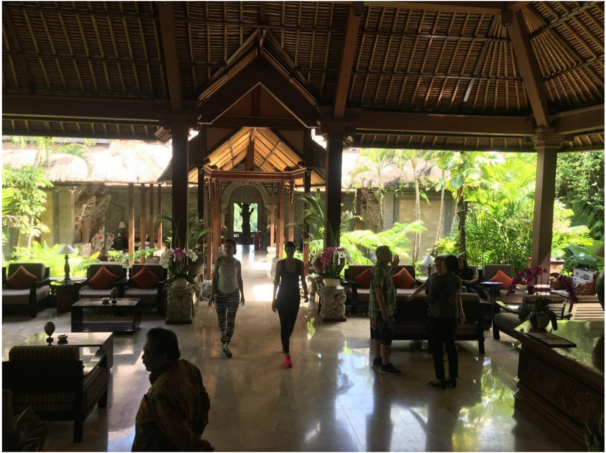
Entrance of the Pita Maha Resort & Spa