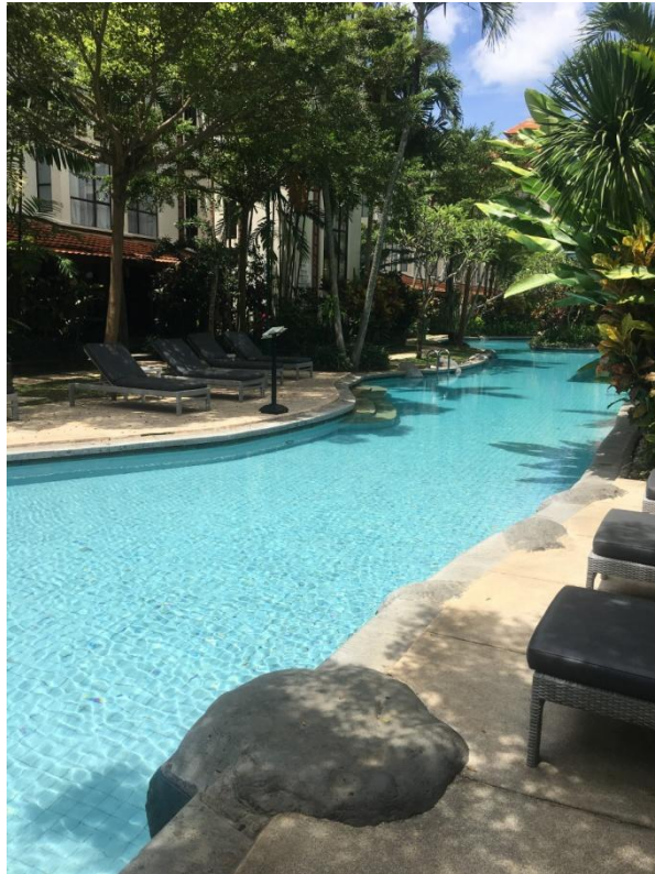
Swimming pool of the hotel