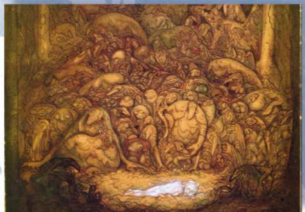
Image: "Root Trolls" (1917), John Bauer (1882-1918), Sweden

Where do I come from? Where am I? And where am I going? An empowering workshop including puppet making, storytelling, music, movement and drama. Learning by doing. Limited number of participants, language: English