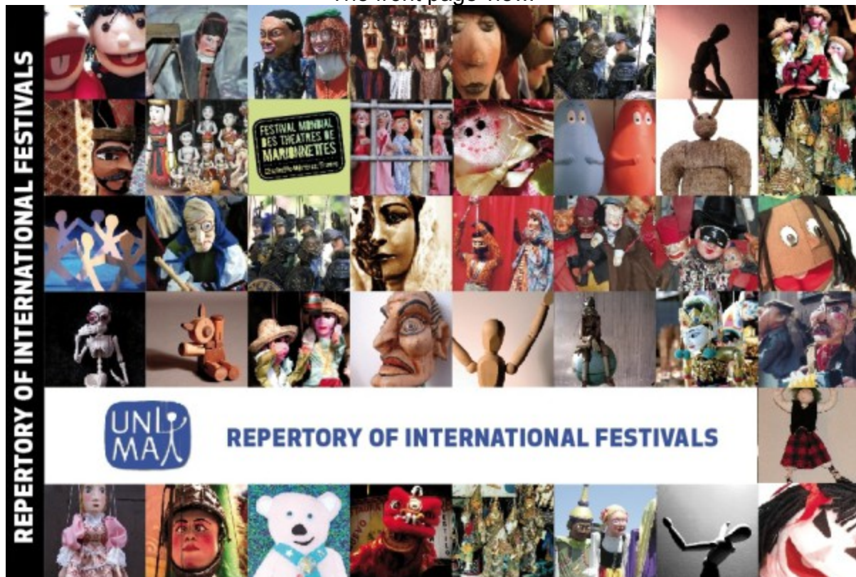
The front page view.

This project was supported by UNIMA Commission Grant.